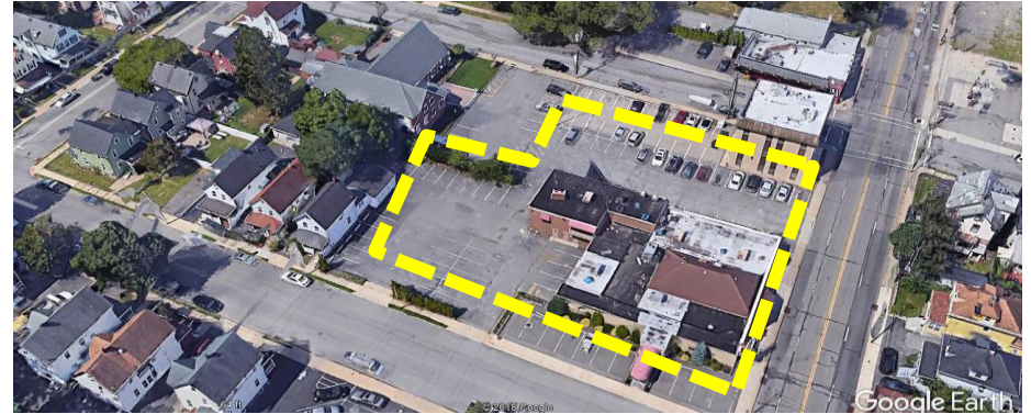
Figure 3: 80 McFarland Street (Route 46)