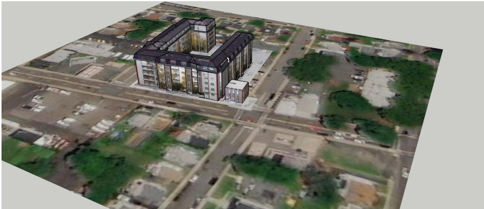
Figure 5: SketchUp model illustration of redevelopment vision.

In the year 2031, Sub-Area 1 has been transformed from a vacant restaurant to a multifamily apartment building. Parking has been concealed within the building. The upper floors contain residential uses. The building establishes a street wall on the two street frontages of the site.