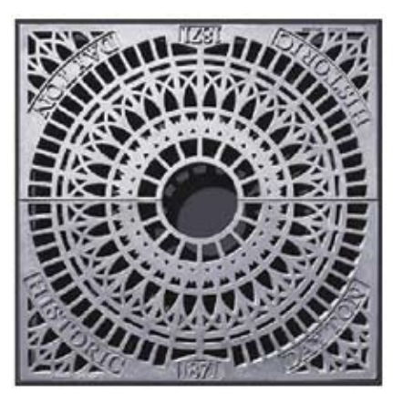
Tree Grate-Typical Material-Steel Color-Standard Grey

Uniform trash receptacles with tops that discourage inhibit residential use;