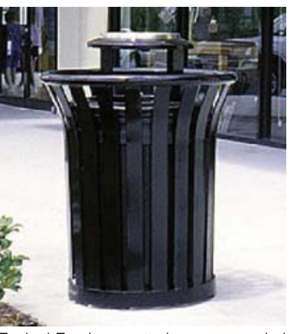
Typical Trash receptacle recommended in this plan

Uniform trash receptacles with tops that discourage inhibit residential use;