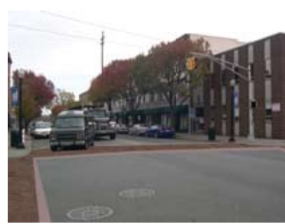
After-Simulation of the typical crosswalk improvement crosswalks

Consistent uniformity with existing streetscape including tree grates;