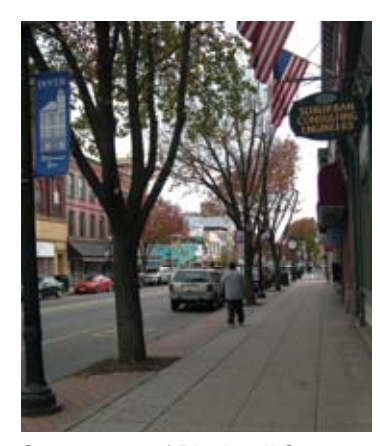
Some areas of Blackwell Street Exhibit great uniformity of streetscape

Consistent uniformity with existing streetscape including tree grates;