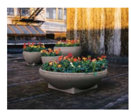
A typical planter that is recommended whithin any plaza or pocket park.

Planters- when implemented, should be uniform in style.